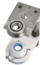
FOR MEYER B2 OLDER FILLERS