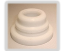
Snift Block ID <1.5"