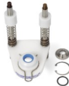
FOR MEYER TRI-STAR