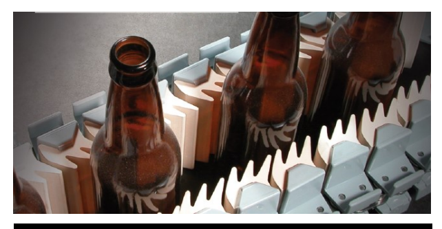
"D" Style and "J" (3-Finger Style) Grippers